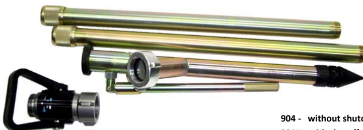
904 - without shutoff valve 904K - with shutoff valve

These piercing nozzles feature a unique safety handle. The safety handle allows a firefighter to safely hold the unit when a mallet is being used to drive the nozzle in. They come with 1.5 NST threads as standard. Other threads are available. Designed for the rugged demands of the fire service world wide. Mounting Brackets included. All models available with or without valve.