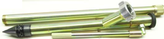
902 - without shutoff valve 902K - with shutoff valve

These new nozzles combine the best of durability, flexibility, and are lightweight. They all have removable nozzles which allow for extension tubes to be added for extra reach (2 feet per extension). They can also be driven in with a small mallet if needed. This unique nozzle design needs to be driven in only 1.75 inches to have full penetration of the sprayer unit. Ideal for breaching walls, coverage of up to 25 feet in all directions. It is powerful enough for fires in attics,